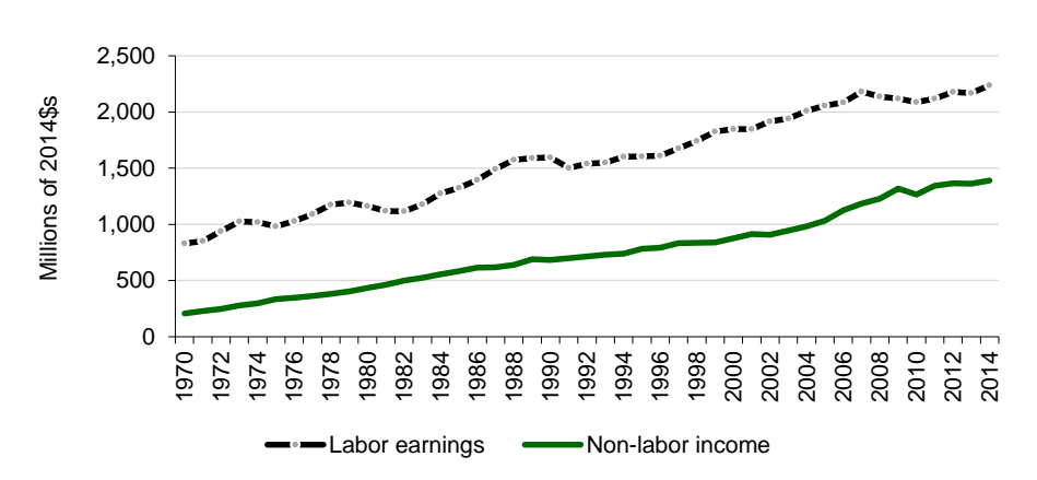
FIGURE 2: COMPONENTS OF PERSONAL INCOME, MONTGOMERY COUNTY

healthcare and financial services. The increase in migration is one reason for the 13.5% increase in employment in the real estate and rental and leasing industries since 2001. More new residents means more real-estate transactions and more opportunities (jobs) for Realtors, rental agents, and support services.